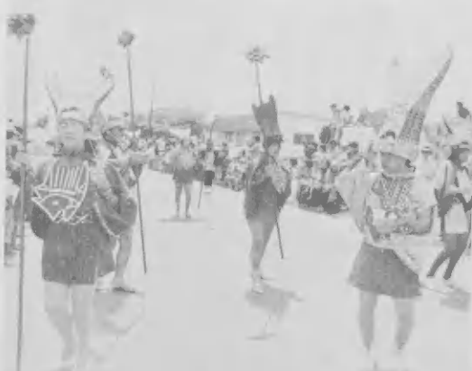
Life Under Water